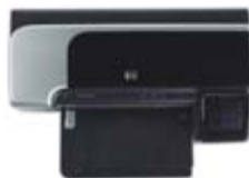
HP Officejet Pro K850 color printer (C8177A)