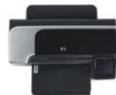
HP Officejet Pro K850dn color printer (C8178A)